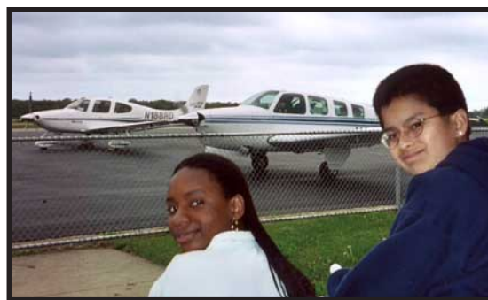
Scarlett Middle School students explore careers that use applied math at the Ann Arbor Airport

During the past year (December 2002 through November 2003) our site recorded 10.9 million hits. Nearly 700,000 unique users made more than a million visits, requesting more than 5,000 separate pages each month. Fewer than 3% of users find us through our home page. About 10% come to us through our Lessons by Age and Subject page; another 11% go directly to a page within the site, indicating that they have searched for a particular topic; and 5% come in through our child-oriented portal. Users come from a monthly average of 111 countries, from .ae (United Arab Emirates) to .zm (Zambia).